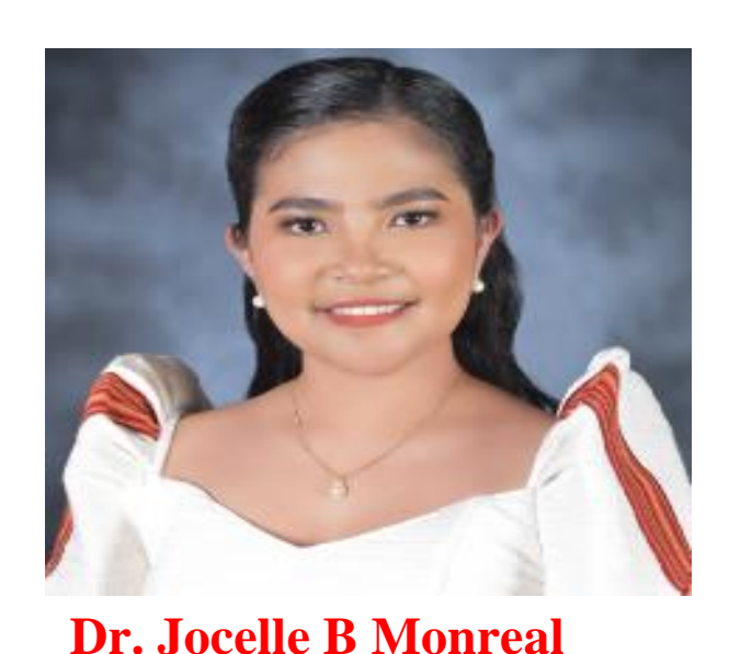
Program Administrator Department of Information Technology Education Sto. Domingo Community College Sto. Domingo Albay, Philippines.